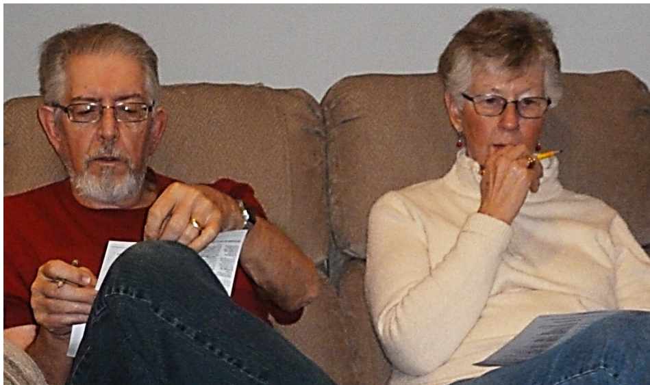
Put on those thinking caps