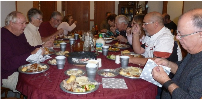
Sharing a meal together