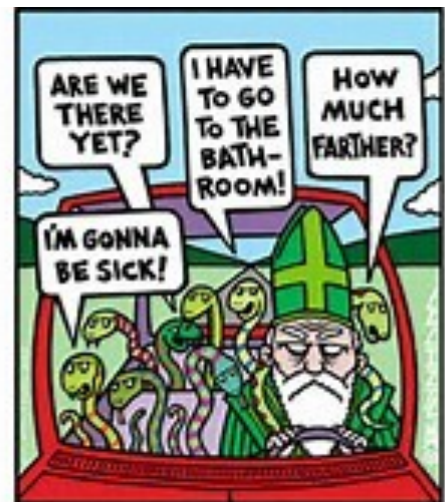
St. Patrick driving the snakes out of Ireland.

FOR SALE - Single owner tomb. Only used three days, and still has that new tomb smell. Reason for sale... resident was resurrected.